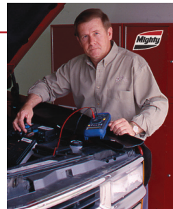
By Larry Hammer Technical Services

Timely maintenance is imperative in keeping the engine free of contaminants.